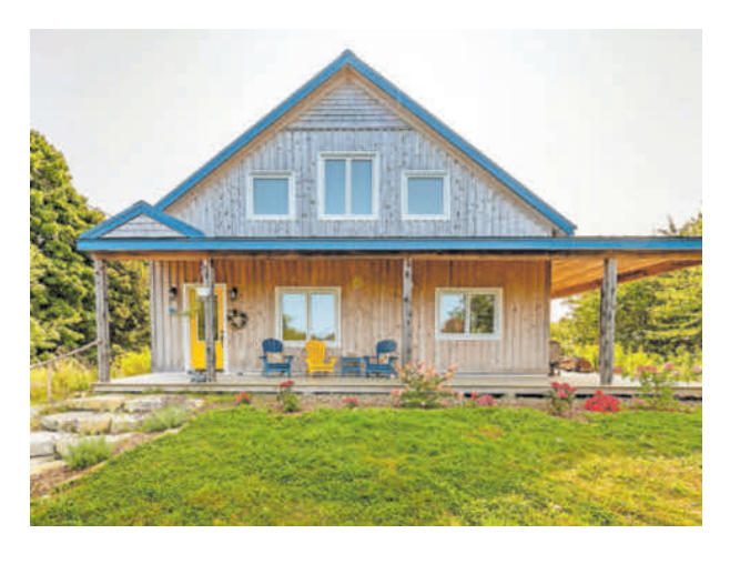
A 1,300-square-foot house in Nova Scotia, Canada, is included in "Bigger Than Tiny, Smaller Than Average."