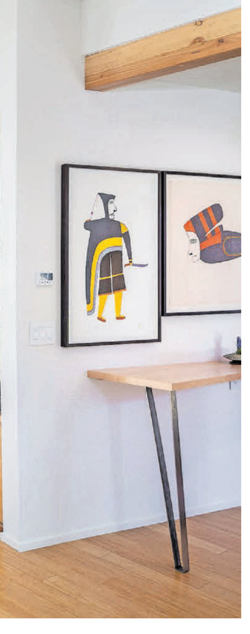
ation. The flooring is highly sustainable