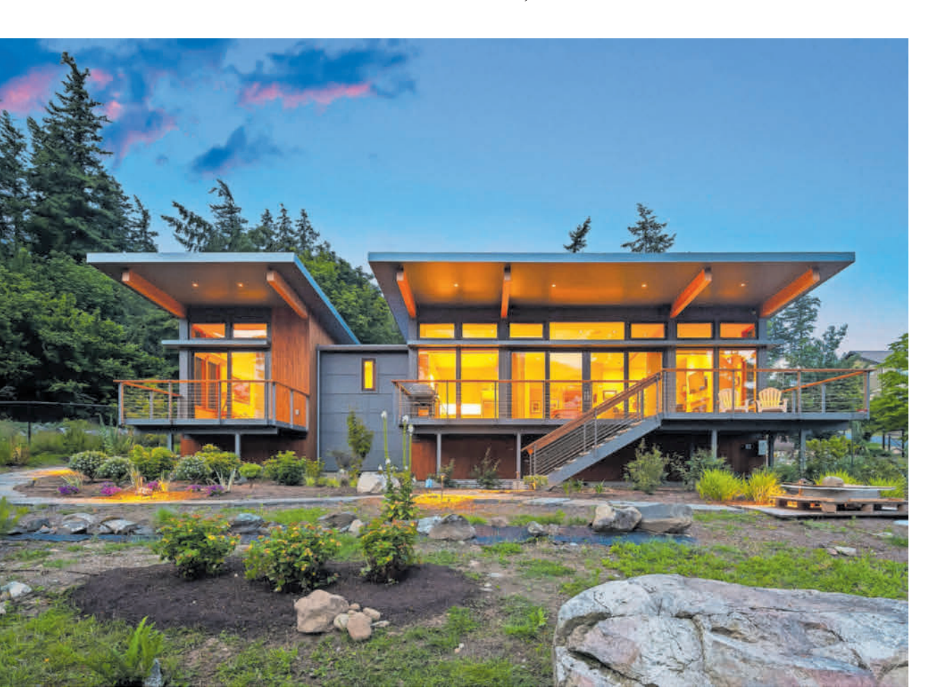
A panelized house in Bellingham, Washington, is 1,634 square feet.