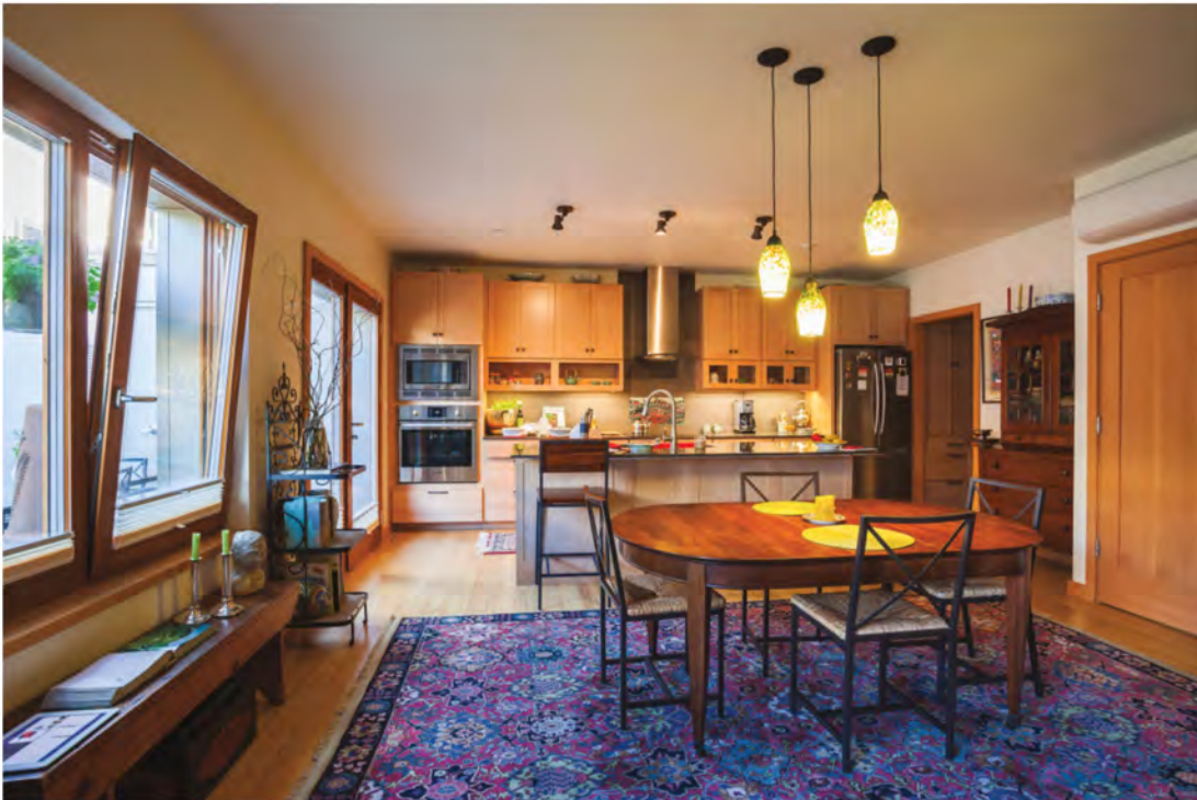
Tilt-and-turn windows manage airflow throughout Ankeny Row.