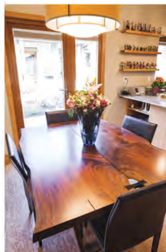
A custom table from Green Hammer’s sister operation Urban Timberworks.

Green Hammer 2 York & Wall Interiors & Design The Figure Ground Studio